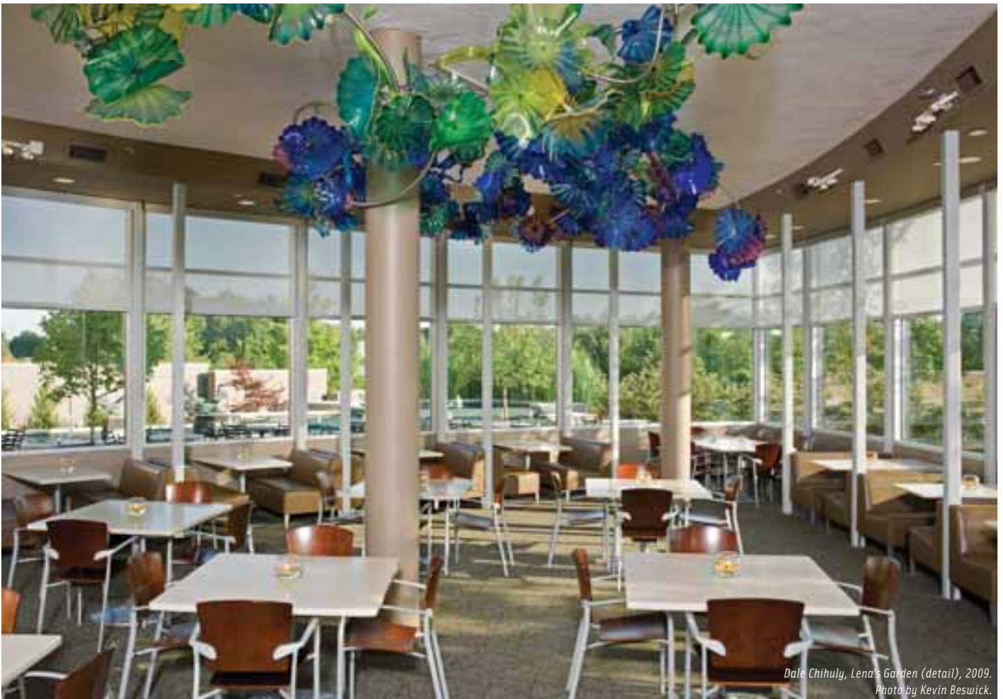
Dale Chihuly, Lena's Garden (detail), 2009.